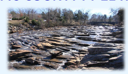
Indian Springs State Park, Flovilla, GA